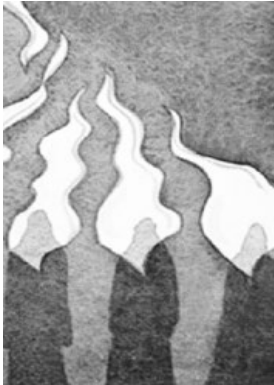
When the Holy Spirit enflames the followers of Christ, nothing stays the same.

In religion and spirituality if something divine and invisible becomes real and perceptible, it is said to be a manifestation . So, when the Holy Spirit is manifested to us, how we live, relate and act is the living reality of the Holy Spirit.